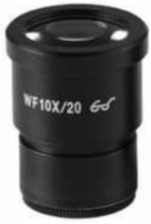
21-1020 Eyepiece WF10x/20mm