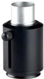
23-E Eyepiece Adapter