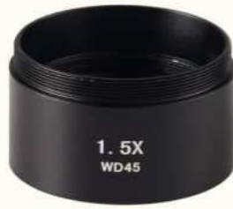
21-15-1.5x, W.D. 45mm