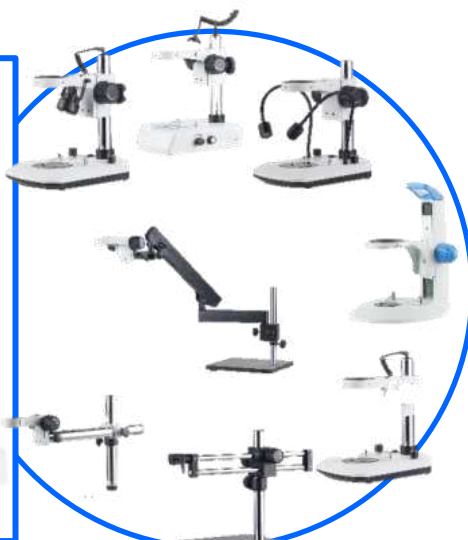
A54.3640 35 Kinds Stands Optional For Different