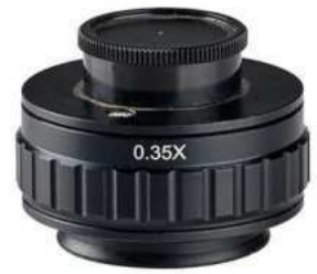
3-35 0.35x, For 1/3"CCD