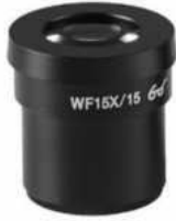
21-1515 Eyepiece WF15x/15mm