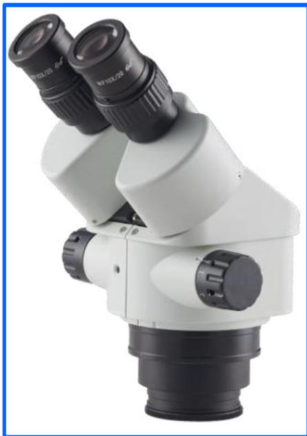
45N-B Binocular Head +WF10x Eyepiece