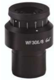
22-3008 Eyepiece WF30x/8mm(Diopter (Adjustable)