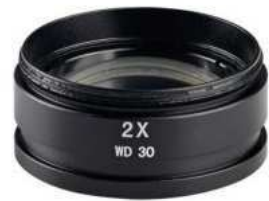
21-20-2.0x, W.D. 30mm