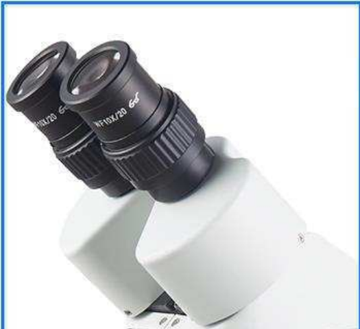
Eyepiece WF10X/20mm, High Eyepoint, Eyepiece Tube Diopter Adjustable