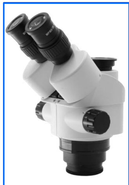
45N-T Trinocular Head +WF10x Eyepiece