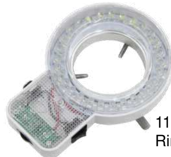
11-B-LED Ring Light