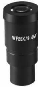
21-2509 Eyepiece WF25x/9mm