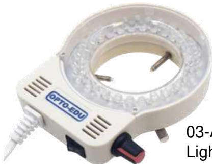
03-A LED Ring Light, 56 LEDs