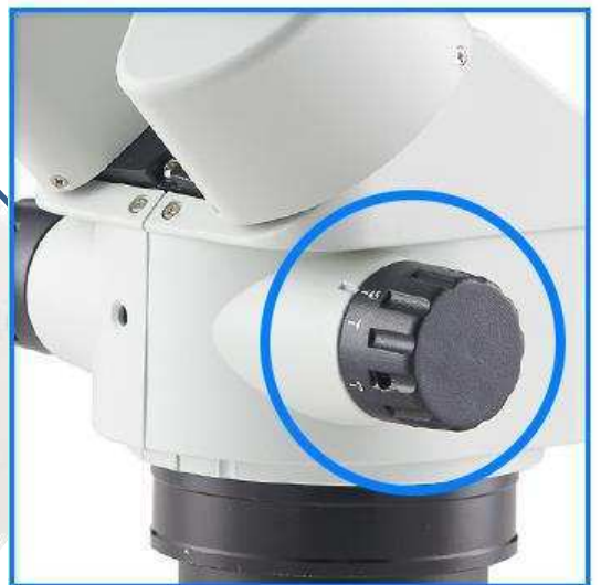
0.7x-4.5x, Magnification Up To 3.5x-180x With Optional Eyepieces And Auxiliary Objectives