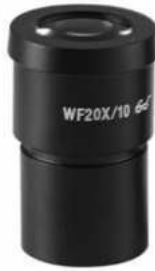
21-2010 Eyepiece WF20x/10mm