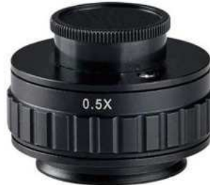
23-05 0.50x, For 1/2"CCD