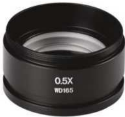
21-05 0.5x, W.D. 165mm